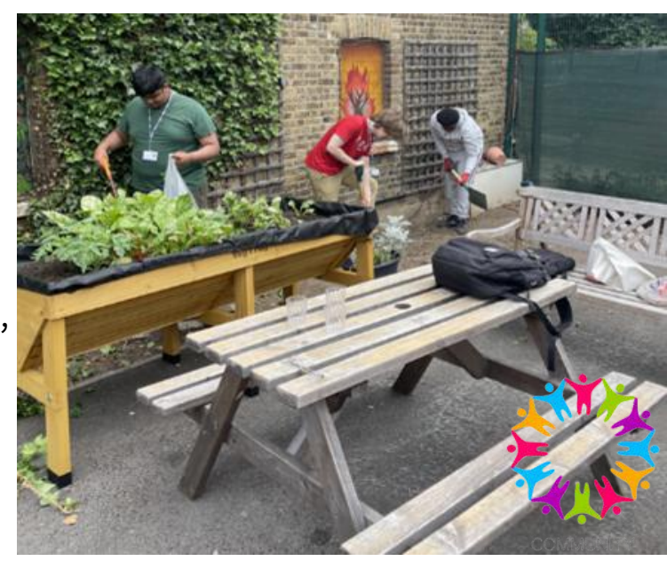
"Each of you should use whatever gift you have received to serve others, as faithful stewards of God's grace in its various forms." 1 Peter 4:10

By seeing the difference, they made to their community, we hope the day will encourage more Holy Family students to take part in volunteering. Well done to all the students who took part!