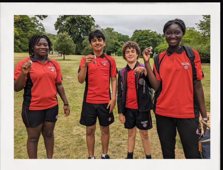
Year 9 Geography Trip to Kew: the scavenger hunt winners with their prize!